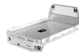
ALUMINUM DROP SIDES