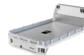
ALUMINUM 6" HIGH SIDES