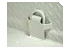
CARGO TIE DOWNS