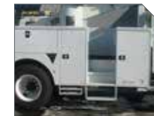
SIDE ACCESS STEPS