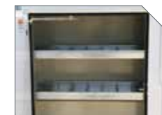
SHELVING AND DIVIDERS