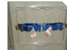
BOTTLE GAS RETAINER