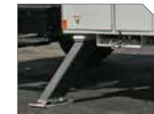
OUTRIGGER PAD CARRIERS