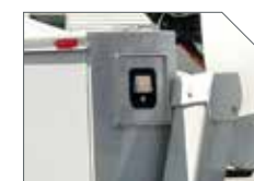
REAR ACCESS DOOR AND FULL LENGTH SHELF