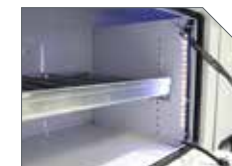
LED COMPARTMENT LIGHTING