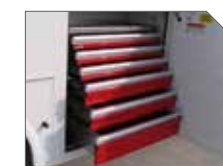
ALUMINUM MECHANICS DRAWERS