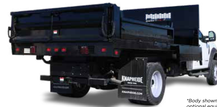
*Body shown with optional equipment.