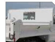
STRAIGHT QUARTER CAB PROTECTOR

'-P' denotes prime paint; '-B' denotes black finish paint. GM C/K 3500 chassis applications