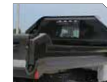
TAPERED QUARTER CAB PROTECTOR