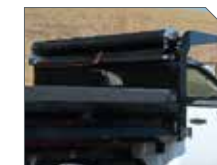
STRAIGHT FULL CAB PROTECTOR