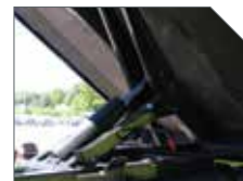
BODY RAISE INDICATOR