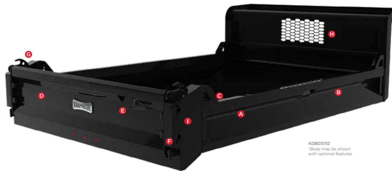
KDBDS1112 *Body may be shown with optional features

constructed of 10-gauge high tensile steel with a punched window for visibility