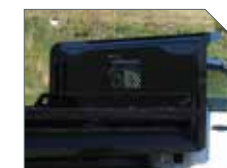
STRAIGHT FULL CAB PROTECTOR