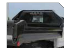
TAPERED QUARTER CAB PROTECTOR