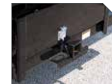
CLASS V RECEIVER HITCH