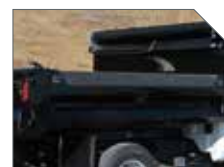
POLY BOARD EXTENSIONS