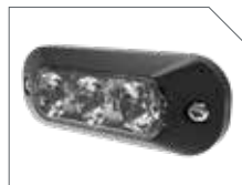
FRONT STROBE LIGHTS