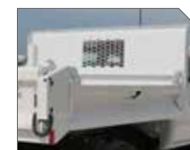
STRAIGHT QUARTER CAB PROTECTOR

'-P' denotes prime paint; '-B' denotes black finish paint.