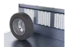
SPARE TIRE RETAINER