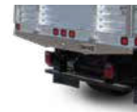
CLASS V RECEIVER HITCH