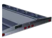
UNDERBODY STORAGE COMPARTMENT