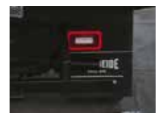
KNAPHEIDE LED TAIL LIGHTS