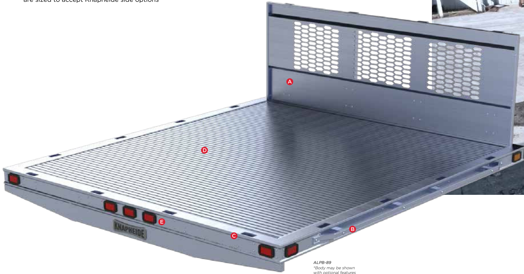
ALPB-89 *Body may be shown with optional features