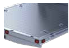
INTEGRATED D-RING TIE-DOWNS